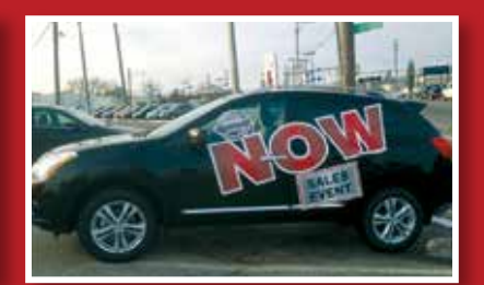
Vehicle Side Wrap